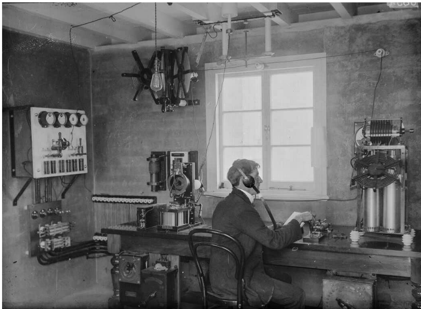
Auckland Radio NZK, later VLD, then ZLD, at the Chief Post Office, Queen Street, Auckland, in 1912. Photo sent in by Neil, ZL1NZ. See more on- maritimeradio.org

NEXT MEETING- Sunday, SEPTEMBER 10th at 1PM. Snacks, coffee and tea provided.